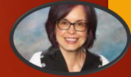
Kāshā ushyeh Land Acknowledgement: Hazelton